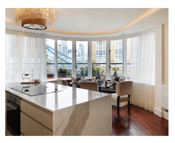
Shad Thames townhouse apartment was designed by Almas Shamsee, Maisha Design and completed in November 2014.

This four storey apartment needed a lot of work. Almas Shamsee reconfigured aspects of the space, including replacing the two staircases, a project that involved rewiring the whole apartment. The apartment is built on a curve, so many of the spaces are oval, giving each room a very unique feel. It is built over three floors, with the bonus of a crows nest that Almas has turned into a gym. which has an uninteruppted 360-degree view. Almas' elegant design complements the vista without detracting from it. The kitchen was themed around a large piece of Calacatta Oro marble, which has been used for the tops of the kitchen units and the island. The master bedroom scheme is slightly moody in tones of grey with pops of orange with sheer roman blinds covering the four picture windows so that you can make the most of the beautiful view without being overlooked. The top floor is one large open plan living space, with two distinct areas; one for relaxing and one for entertaining. The focal point of the main living area is an unusual and striking chandelier, hand-blown from recycled glass by Kitengela Glass in Almas' native Kenya.