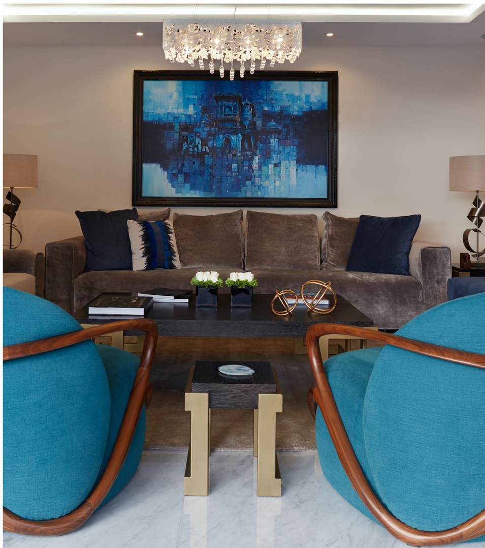
The seven month project saw the apartment reduced to a shell before being reconfigured and rewired.